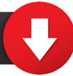
Plate N Sheet Professional 3.9.9.66